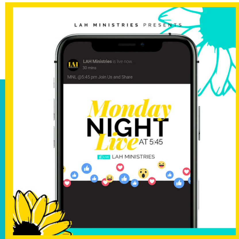
Monday Night Live at 5:45pm

At LAH Ministries... We are growing somewhere